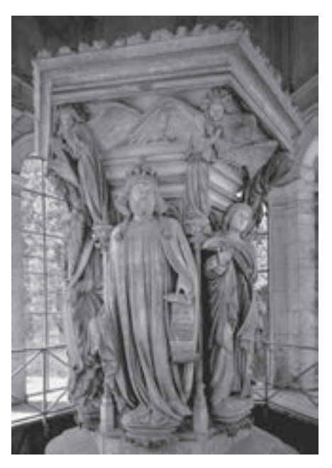
Figure 4. Claus Sluter and his workshop, Well of Moses , 1395–1403, 179 cm, Musée Archéologique, Dijon

prominent example are still extant in the Carthusian monastery at Champmol, more specifically, the Great Cross made by Claus Sluter and his workshop between 1395 and 1403, today known as the Well of Moses (Figure 4).<sup>47</sup> The Carthusian monastery at Champmol was founded by Philip the Bold on the outskirts of Dijon in 1381. The Great Cross originally stood in the central courtyard of the monastery. Three indulgences were granted in the fifteenth century to those who visited and venerated the Great Cross. The first one, which was worth fifty days of remission with a hundred days on Good Friday, was given by Cardinal Giordano Orsini in 1418. The second indulgence for fifty days was issued by Cardinal